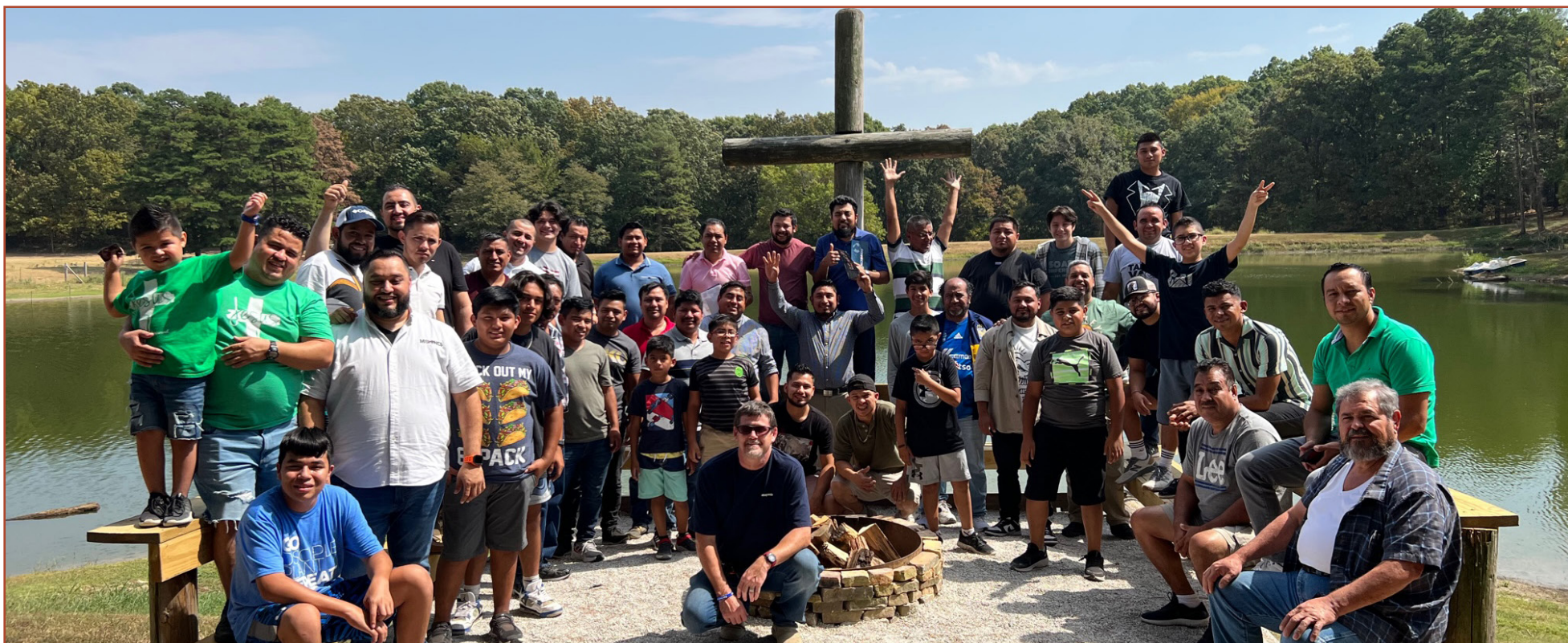
Hispanic leaders of Arkansas gather for a spiritual retreat in June 2022.

71 years (1951-2022) of sharing the gospel across ARkansas and beyond. Our heARtbeat is to see lives changed for the glory of God as we spread the gospel by planting new churches in AREas where people need to be connected to Jesus through a community of faith.