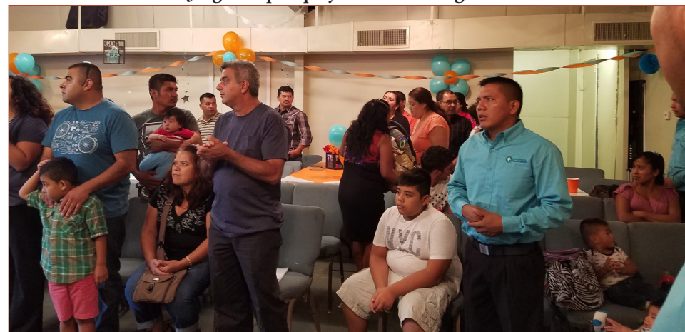
Worship service at La Gran Comisión.