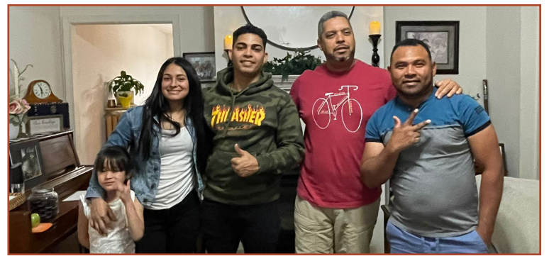
Monday night Bible study group.