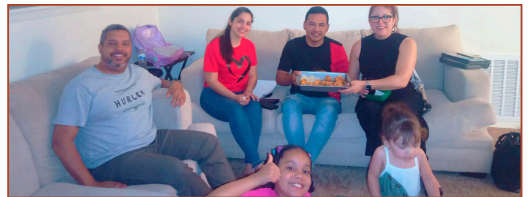
Wednesday night Bible study group.