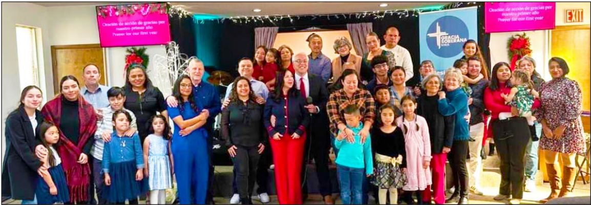
Misión Gracia Soberana (Sovereign Grace), NWA celebrates one year as a mission.