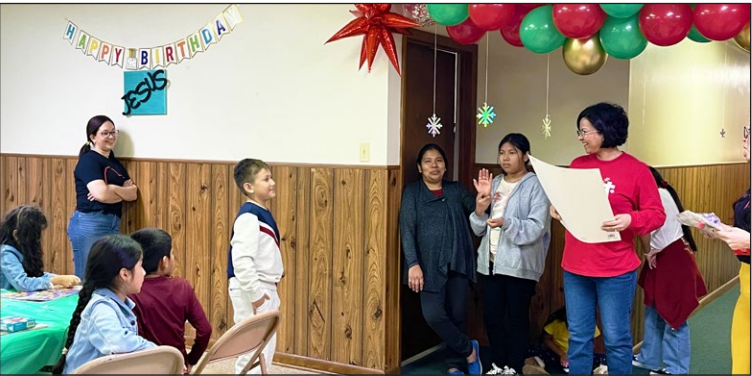
Misión Creciendo en Cristo (Growing in Christ), North Little Rock hosts "The Birthday of Jesus" celebration.