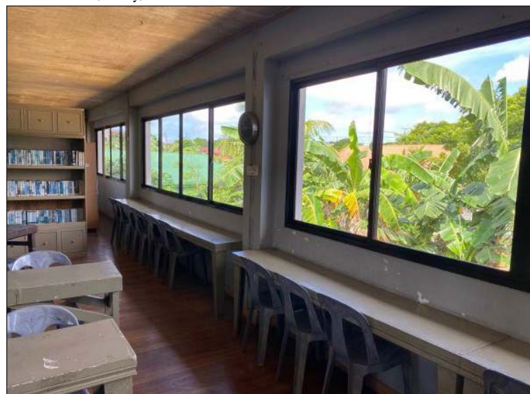
New windows in the library at BMABC.

Money for work funds, personal support, BMABC, Scholarship funds, DCCA and special projects can be sent to Mill Creek Baptist Church, 11 Old Kiln Road, Picayune, Miss. 39466 or BMAA Global Missions, P.O. Box 878, Conway, Ark. 72033. Please note on your check which project it is to be used for. Donations are tax deductible.