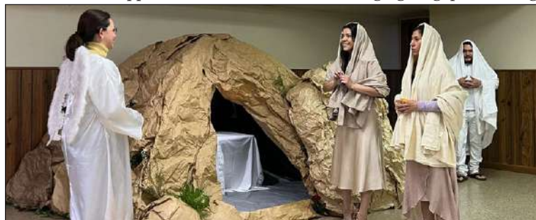
Misión Creciendo en Cristo (Growing in Christ), North Little Rock dramatize the passages related to Jesus resurrection.

"This week was strange for me in that we didn't do anything special for Easter. Praying through it this past month, we felt it was more important that we try to keep up the rhythms of our weekly Connection Groups, monthly Coaches Meeting and monthly Collective Worship Gathering rather than trying to move our worship night or hold another one. This went against all I typically do as a pastor, but from the conversations we had this past week, I do believe we made the right move and look forward to that coaches' meeting Sunday.